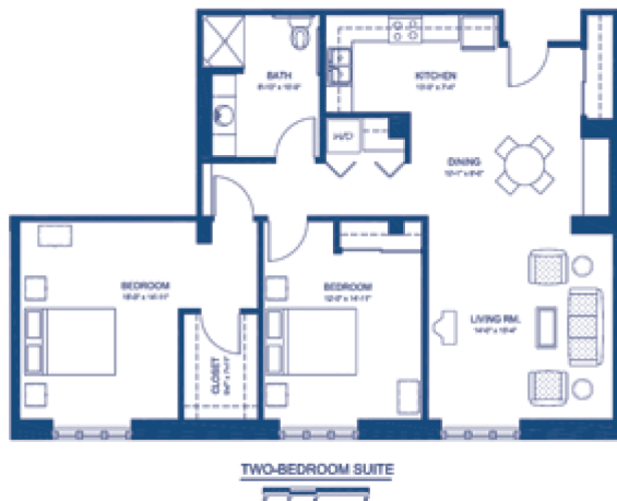
Suite A Floor Plan